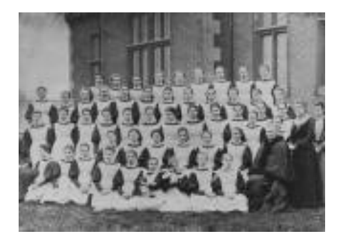
I assure you that both uniforms, and dormitories have undergone a radical change!